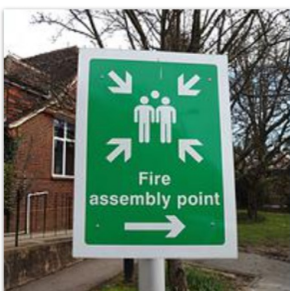
Fire Safety Management